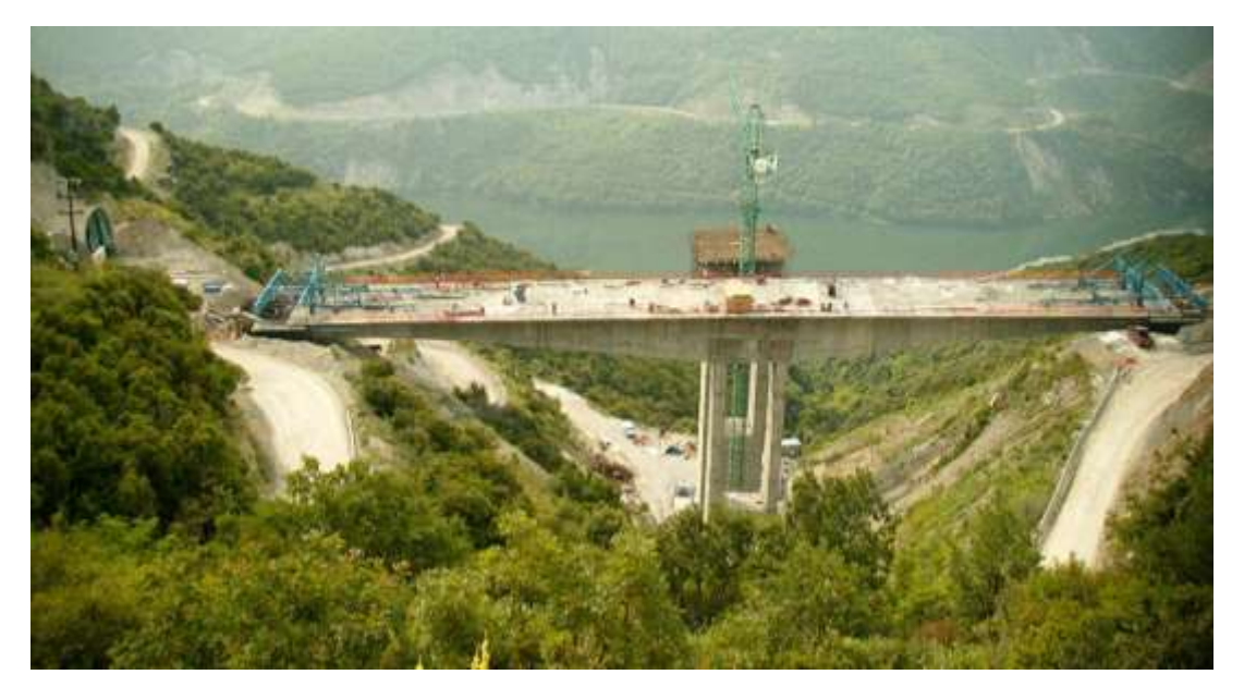
Construction of Bridge \ensuremath{\Gamma1} with the balanced cantilever method

left branch was 166.0m (80.0+86.0). In addition, the maximum height from the deck surface to the foundation level was approximately 46.0m for bridge \Gamma 1, 55.0m for the left branch of bridge \Gamma 2, and 44.0m for the right branch. The abutment height varied between 3.0 and 8.9m and 3.0 to 9.96m for both bridges \Gamma 1 and \Gamma 2, respectively.