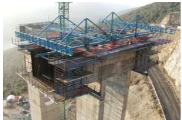
First construction phase of the deck segments

The total deck width of each branch was 14.0m: 11.0m for the road surface and 3.0m for the two sidewalks. In addition, the two bridge branches had a distance between them that ranged between approximately 5.0 and 15.0m.