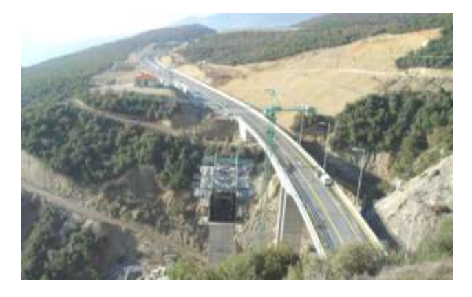
Bridge F2: The construction of the right branch has been completed -The left branch is under construction

Bridge Г1: The construction of the right branch has been completed - The left branch is under construction